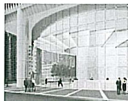
Destination: 111 S. Wacker