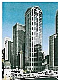
Origin: The Donnelley Building

Separately, Boyer-Rosene managed the move of Donnelley Logistics from their warehouse and operations facilities in Willowbrook, to a new state-of-the-art 660,000 s.f. facility in Bolingbrook, Illinois.