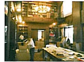
The Gaylord Donnelly Library

During the set-up period for the valuable collection, the books were carefully packed, transported to the new facility, and guarded overnight until they could be unpacked by Boyer-Rosene's crew, and carefully placed in locked display cabinets.