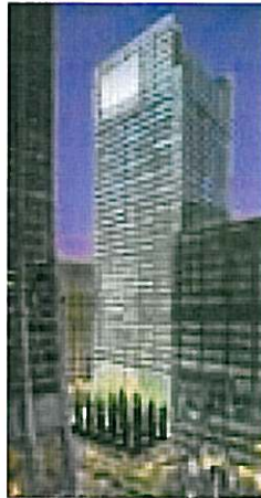
The new building at 1 S. Dearborn

Sidley Austin had a unique dilemma for their recent relocation. They had Hines build a new office building at 1 S. Dearborn. As the anchor tenant of this 820,000 sf, 40-story building, they would be the first firm to move in, but they would also have very little time to do it. Construction schedules and lease expirations for their previous space required a 'round the clock relocation over the Thanksgiving weekend. Boyer-Rosene was selected after a city-wide search of capable office movers as the best firm to manage and carry out this demanding schedule.